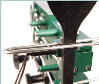
Specimen attachment with Model 3800

Please let us know at the time of order what type of output and connector you require.