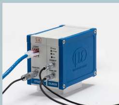
Model DT6229 single-channel signal conditioner provides analog and digital outputs