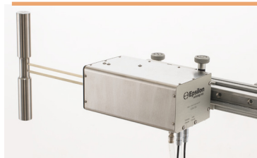
Model 7650A axial extensometer

This high precision extensometer measures axial strains on specimens at temperatures up to 1600 °C (2900 °F). Compatible with materials testing furnaces or induction heating. May be used for strain-controlled, high frequency fatigue tests. Slide mounting system enables mounting to hot specimens in seconds.