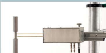
Model 7650A extensometer with rigid load frame mounting

The Model 7650A is often customized for specific test needs. Contact Epsilon for a configuration that matches your requirement.