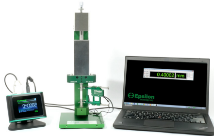
Model 3590VHR calibrator with included Touch Display digital readout and software (computer not included)

The 3590VHR calibrator has the high resolution and accuracy required to calibrate and verify extensometers to ASTM E83 Class B-1 and to ISO 9513 Class 0,5. The 3590VHR's resolution is 20 nanometers.