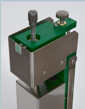
Coarse and fine adjustment knobs for fast and accurate positioning

A wide range of adapters are available to allow use with axial, transverse, shear, and many other specialized extensometers. The calibrator comes with round adapters (9.52 mm [0.375 inches] diameter) that work with many typical axial extensometers. Specialized adapters are available. For very long gauge length extensometers, optional extension posts are available.