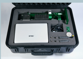
Model 3590VHR calibrator storage case

▶ See the Model 3590VHR extensometer videos