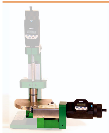
Model 3590-TORSION with a model 3590 axial calibrator

Epsilon's 3590-TORSION Calibrator Accessory is designed for use with Epsilon models 3590 and 3590VHR Calibrators. It is designed for torsional calibration or verification of extensometers, including Epsilon axial-torsional models 3550, 7650, and 3550HT. The accessory includes a mechanical rotation subassembly and a calibrated and traceable linear displacement head.