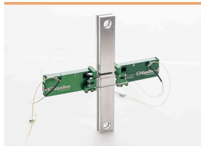
Model 4013 lap shear extensometer

Designed specifically for performing tests in accordance with ASTM D5656, Standard Test Method for Thick-Adherend Metal Lap-Shear Joints for Determination of the Stress-Strain Behavior of Adhesives in Shear by Tension Loading. The deformation is measured on opposite sides of the test specimen and the output is an average of the two readings.